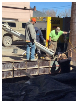
Construction workers labor on the project.

Washakie County Library’s Worland location’s construction project is well underway. The project’s main objective is expanding the children’s section of the