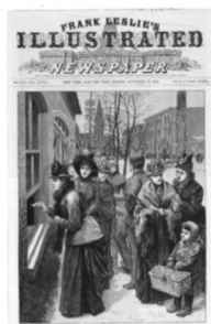
Wyoming was the first state to allow women to vote in an election.

March was National Women's History Month and included 307 Day on March 7, but any day is a great opportunity to explore Wyoming history, including the numerous valuable contributions made by women. Read more about how to use the Women's Suffrage in Wyoming