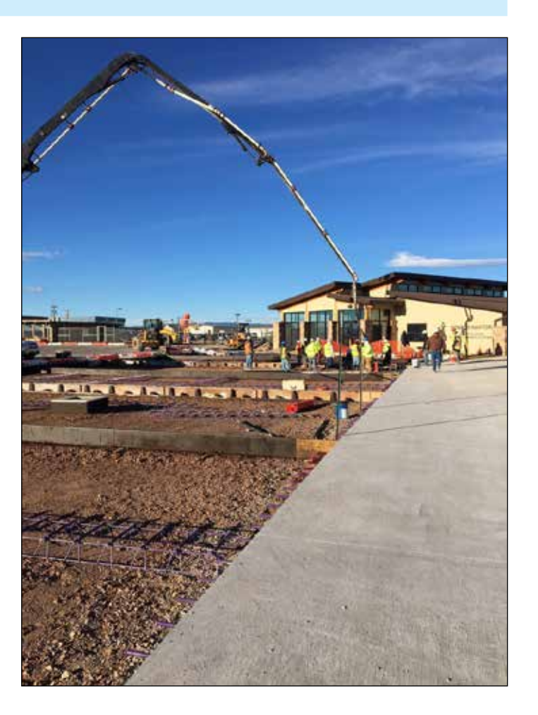
for commercial and business aircraft at the airport. The project was designed and managed by Jviation of Denver, Colorado.

The project included complete reconstruction of portions of the main apron and was funded by the Federal Aviation Administration, WYDOT and the Laramie Regional Airport. The project will help ensure a safe operating environment