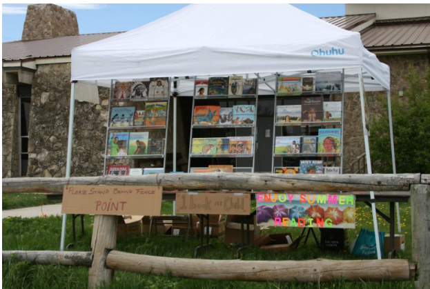
The book giveaway display. Book distribution began the week of May 18 and will continue through the summer.

CARES Act funding is supporting summer reading on the Wind River Indian Reservation through book distributions to students and families. The Wyoming State Library used approximately $5,000 for the project from the $52,297 it received from the Institute of Museum and Library Services “to address digital inclusion” or “other efforts that prevent, prepare for, and respond to COVID-19.”