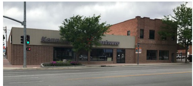
The former Ace Hardware building, soon to be home to the Washakie County Library.

On June 16, the State Loan and Investment Board (SLIB) approved a $500,000 grant to Washakie County for renovations of the former Ace Hardware building to be used for the Washakie County Library, Washakie Development Association, and the Worland-Ten Sleep Chamber of Commerce. Space will be created in the 19,452 square foot building for business incubation, entrepreneurial use, and workforce training.