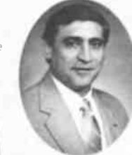
Carl Malden SWEETWATER