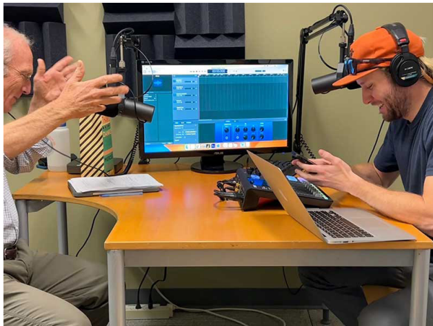
The studio in action.

Study Room 6 at Teton County Library has lately been under construction behind a dark curtain, but clues have slowly revealed its new identity. First, a red neon “ON AIR” sign was installed, and recently, a window decal told all: Wonder Institute Recording Studio . Library patrons are now able to reserve this specialized space to produce polished audio and visual content for podcasts, YouTube videos, websites, and more.