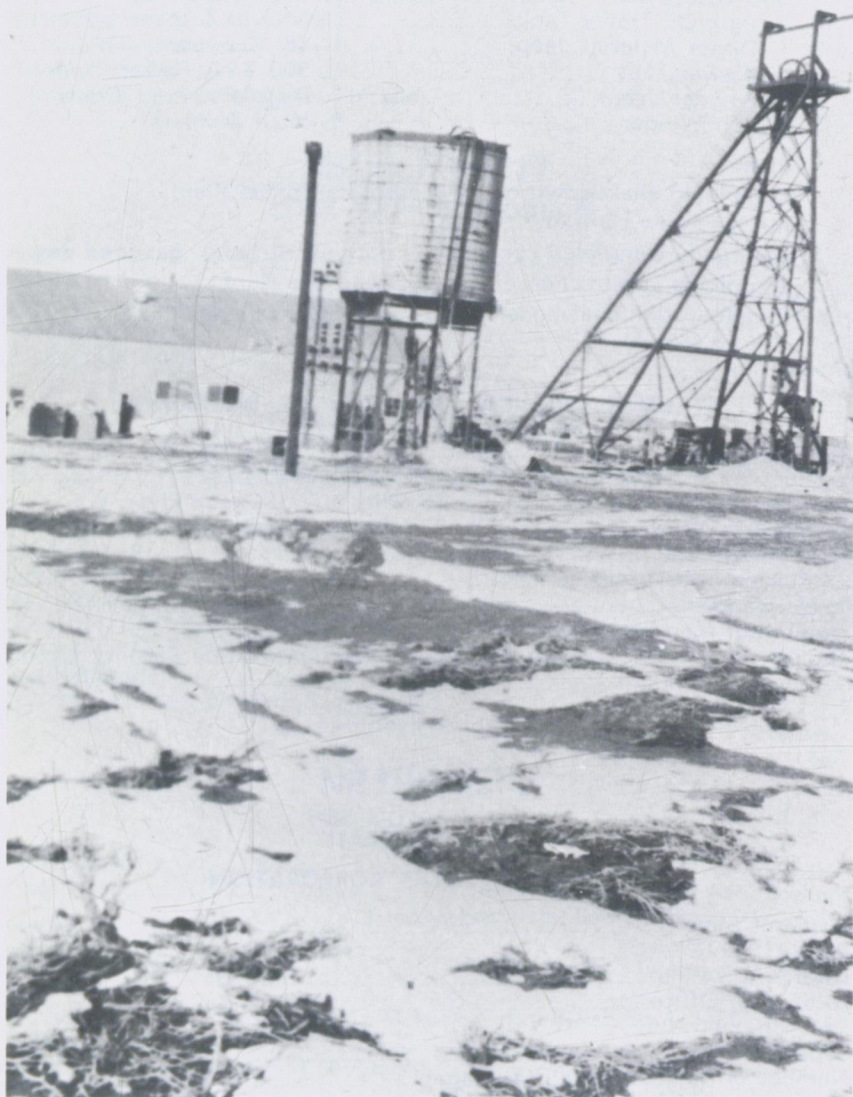
Head Frame and Construction at the new shaft, Allied Chemical Company located 19 miles West of Green River, Wyoming.