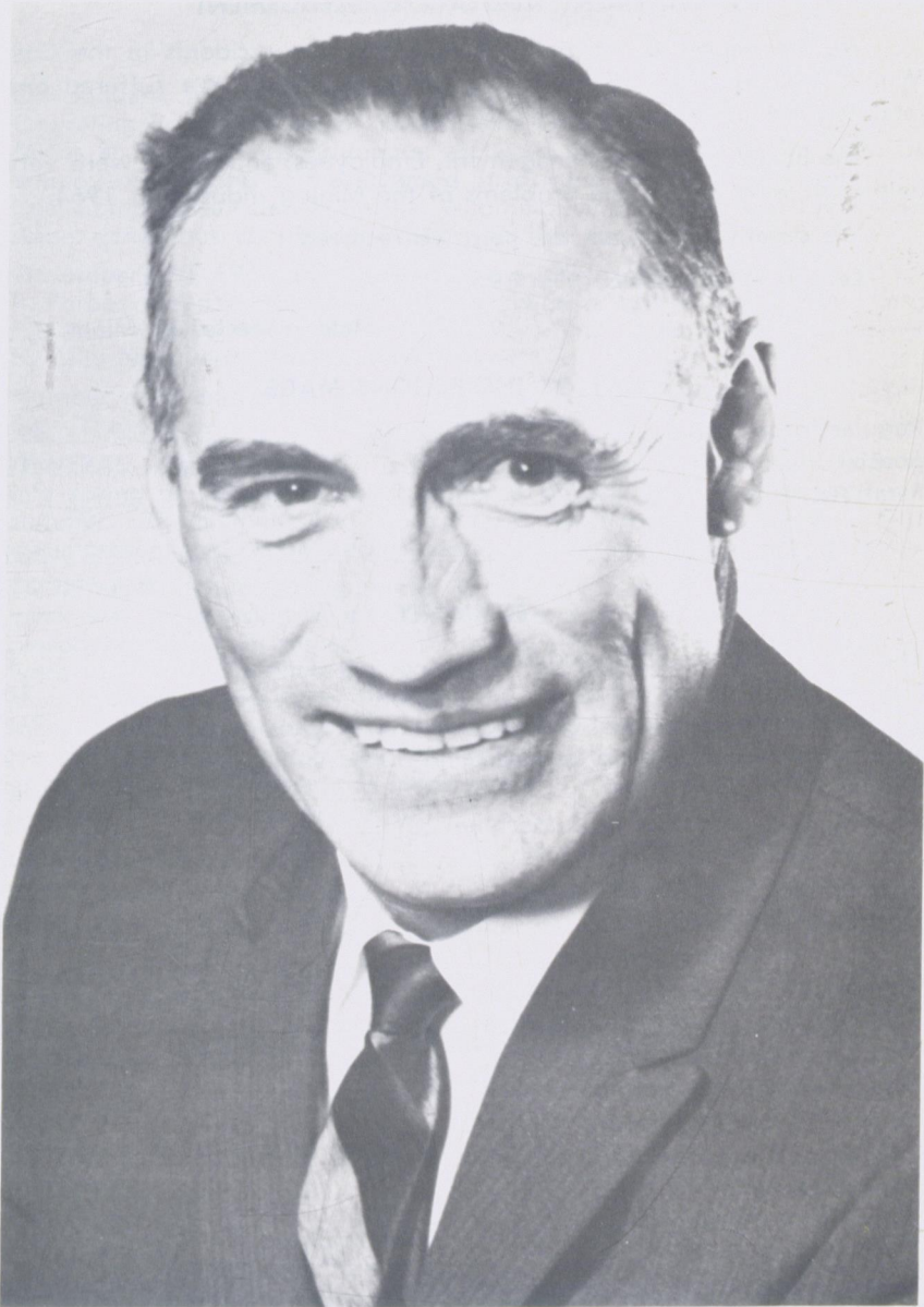
CLIFFORD P. HANSEN