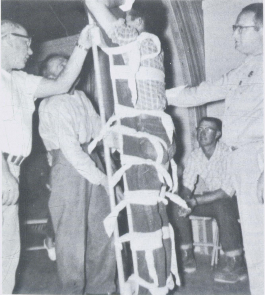
First Aid Class held at Jeffrey City, Wyoming Western Nuclear Company 1964