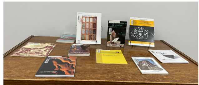
The Wyoming State Library's current display of books on geology.

September 16 was Collect Rocks Day! Looking for resources to help you identify that shiny stone you found or the know the geological history of the beautiful boulder you saw on your weekend drive? Look no further than the research databases available on the Wyoming State Library's GoWYLD portal ! GoWYLD's general research databases include articles on any topic you think of, including rocks! Gale OneFile, MasterFILE Complete, ProQuest One Academic, and many other databases can help you find the information you need to answer your questions, help you generate more, and become an expert in your field of interest. Check out all the resources available on GoWYLD today!