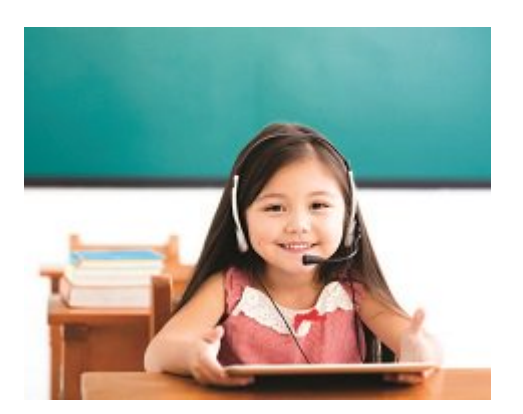
Spring 2018 WATR Professional Development Free Online Distance Learning Course Offerings