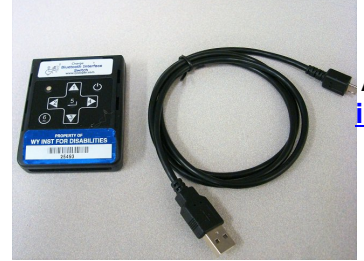
Available for short term loan: iPad/Tablet Switch Interface (w# 25493)