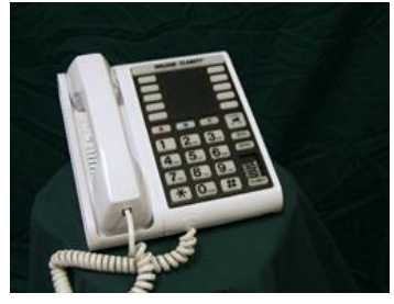
Available for sale through reuse: Walker-Clarity High-Frequency Enhancing Phone (For sale $5)