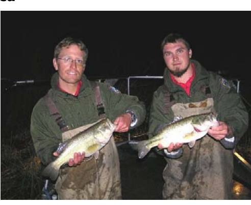
Lake Absarraca largemouth bass

Electrofishing was conducted to evaluate the largemouth bass population. We found good numbers of bass averaging 12.2 inches and 1.3 pounds with several fish over 5 pounds captured. There are a lot of