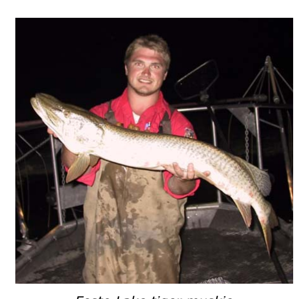
Festo Lake tiger muskie

Analysis of angler interview data from February to September 2005, shows that 125 anglers fished a total of 567 hours and caught 233 fish for an overall catch rate of 0.4 fish per hour. Boat anglers enjoyed more success than shore anglers as they caught 0.5 fish per hour, as opposed to 0.1 fish per hour for shore anglers. February is the best time of the year for fast fishing, as anglers in 2005 caught 0.7 fish an hour. Walleye were in excellent condition in our 2005 sampling and averaged 14.5 inches and 1.4 pounds. Also caught were catfish, which averaged almost 15 inches and just over a pound, however catfish can grow to weigh over 10 pounds. Besides walleye and catfish, black crappie can be caught in good numbers in the spring time.