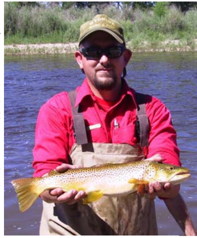
North Platte brown

The trout population in this area has suffered from ongoing drought conditions. Low flows caused by drought conditions has decreased available habitat and increased summer temperatures. The estimated number of fish per mile in 2005 was significantly lower