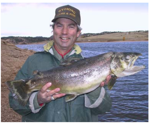
Granite Reservoir brown trout

Granite Reservoir, located in Curt Gowdy State Park, was sampled in 2005 to assess the status of the illegally