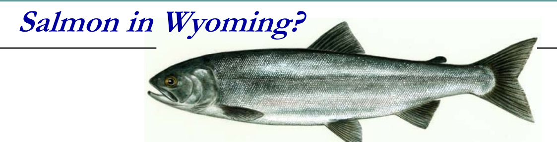
Typical coloration of non-spawning kokanee

When one thinks of salmon, their first thought is of large runs of brightly colored fish swimming out of the ocean and up coastal streams in order to spawn. Their first thought is definitely not of Wyoming. However, salmon do live in Wyoming waters, and specifically in the Laramie Region they are stocked into Lake Hattie. At any one time in Lake Hattie you may catch kokanee from 7 inches up to 20 plus inches, with the average size being 12 to 14 inches. Kokanee, which are a landlocked form of sockeye salmon, are adapted