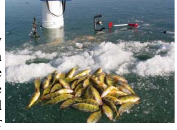
levels. Our Perch caught on Lake spring 2005 Hattie by ice fishermen n e t t i n g

The fishery is still in good shape despite continued low water