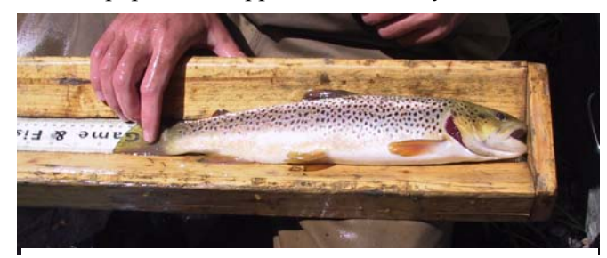
Douglas Creek brown trout

Five population estimates were conducted on Douglas Creek in 2005, two above Rob Roy Reservoir and three below. Currently brook trout dominate Douglas Creek above the reservoir, whereas brown trout are the predominate fish below. The average size of brook trout above the reservoir is around 5 to 6 inches, whereas brown trout below the reservoir average about 6 to 7 inches. However, large brown and rainbow trout can be caught at the right time of year above and below the reservoir. Additionally, 41 other streams within the Douglas Creek drainage were sampled and overall the wild fish populations appear to be healthy.