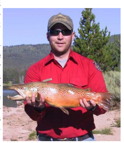
Hog Park brown

Construction was started on the now 695-acre impoundment of Hog Park Creek in 1965-1966. The reservoir was constructed as part of the Cheyenne Water Supply Project and was built as mitigation for Rob Roy Reservoir, which is the city of Cheyenne's water supply. Water is funneled through a complex system of collectors in the North Fork of the Little Snake