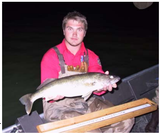
Rock Lake walleye

This lake evaluwas ated in June using electrofishing and gillnetting. The walleye population is doing very well for a small water with an average size of 20 inches and average weight of 3