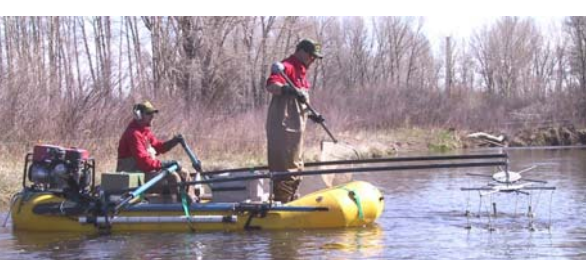
Electofishing the Laramie River

bow trout and keeping 26. Rainbow trout collected during the 2005 sampling averaged 12.2 inches. However, there are some concerns with the condition of the fish, as most rainbows appear skinny. A study is going to be implemented in 2006 to determine what is limiting trout growth in Walker Jenkins Lake.