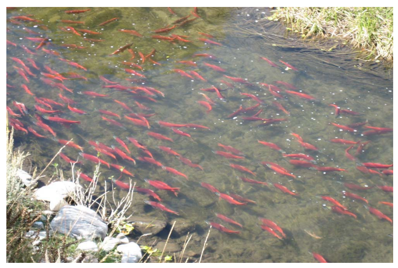
kokanee salmon in spawning colors

to freshwater habitats and do not require access to the ocean to complete their life cycle. Kokanee still retain many of the same color characteristics of sockeye salmon. They are silver most of the year and during the spawning season (October through January) adults turn bright red. During the spawning season, males typically have a hooked lower jaw. After spawning, kokanee die, providing food for eagles, bears, raccoons, etc. Fishing for kokanee is a year round activity at Lake Hattie and remember, daily creel and possession limits apply on trout and salmon.