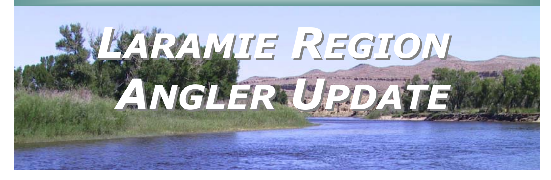
"Conserving Wildlife—Serving People"