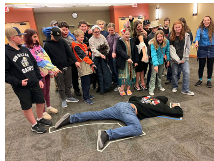
Park County teens play live Clue.

fun and games. The Cody Library recently hosted two game-themed events for kids and teens—a