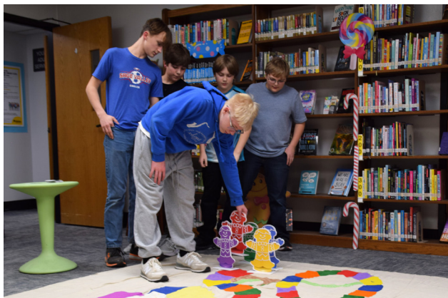
Campbell County teens play a life-sized version of Candy Land.

Campbell County youth had the opportunity to play their hearts out at a special Valentine’s Day event held at the Campbell County Public