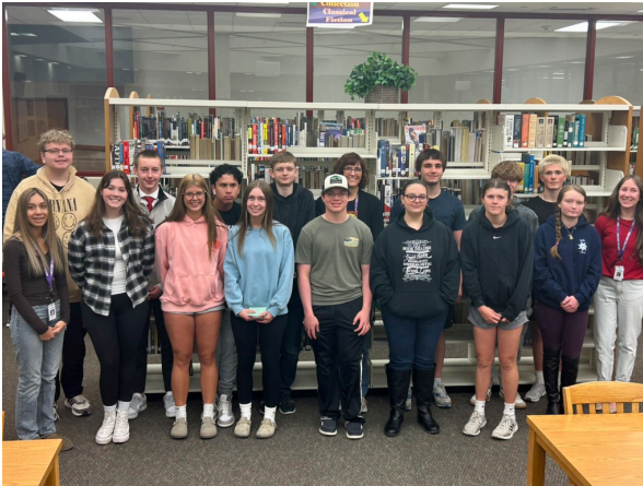
Winners of the Central High School D.E.A.R. Day reading competition

The Cheyenne Central High School library is a bustling place during most school days with students reading, studying, finding materials for schoolwork, and visiting with classmates, but it was particularly busy on April 11. Central High students were invited to participate in a competition in honor of Drop Everything and Read (D.E.A.R.) Day, which is normally celebrated annually on April 12, but took place at the school a day early due to the weekend.