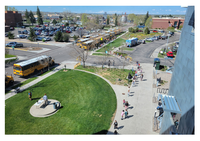
School buses lined up outside Laramie County Library in Cheyenne at the start of the day.