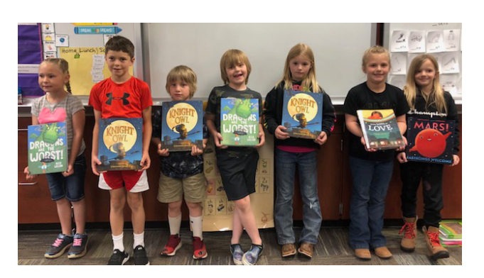
Students with their selections at Kaycee Branch Library.