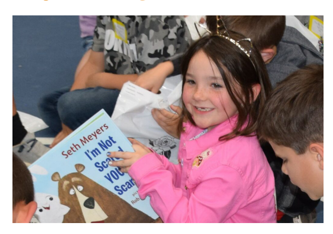
A first grader enjoying her new book at Campbell County Public Library in Gillette.

On May 16, 2023 the 25th anniversary of Wyoming Reads occurred. Wyoming Reads is an initiative to promote literacy as all Wyoming first graders can attend a day in celebration of reading and receive their very own hardcover picture book. All 23 Wyoming counties participated in the 18th statewide Wyoming Reads event that originated in Casper 25 years ago. Approximately 7,100 first graders took part in the celebrations.