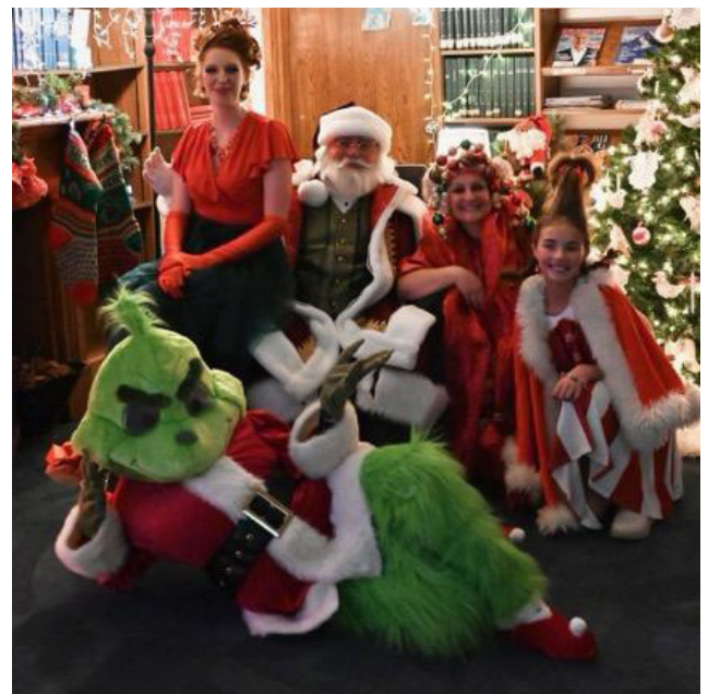
Santa, the Grinch, and friends at the event.

The Uinta County Library in Evanston turned the library into Whoville for a fundraiser for the children’s department. The event was a huge success, raising $4,000 for books and activities. More than 500 people came to see Santa Claus, the Grinch, Martha May, Cindy Lou Who, and the staff dressed as Whoville citizens. Fifteen businesses donated trees to decorate the library. The year-long planning and preparation that went into this event paid off! See more photos on the WSL blog.