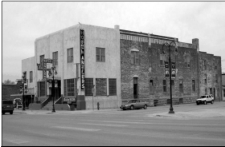
Antlers Motel, Newcastle.

year 2006 grant projects have recently begun and will be completed by September 2007. Grant recipients for fiscal year 2007 have just been selected and have until September 2008 to finish their projects.