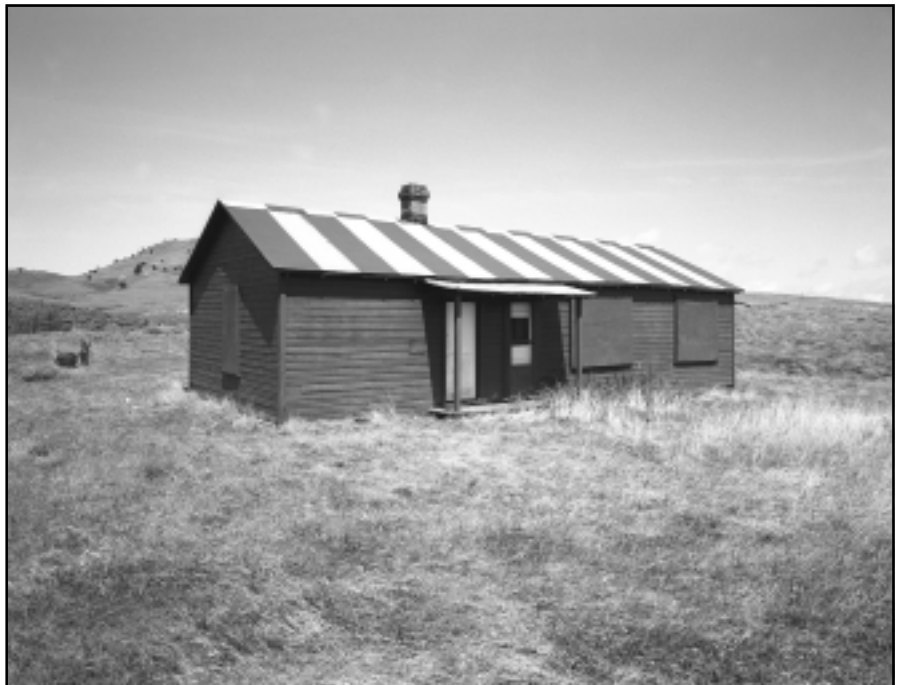
Bunk House, F.S. King Brothers Ranch Historic District, Near Laramie.