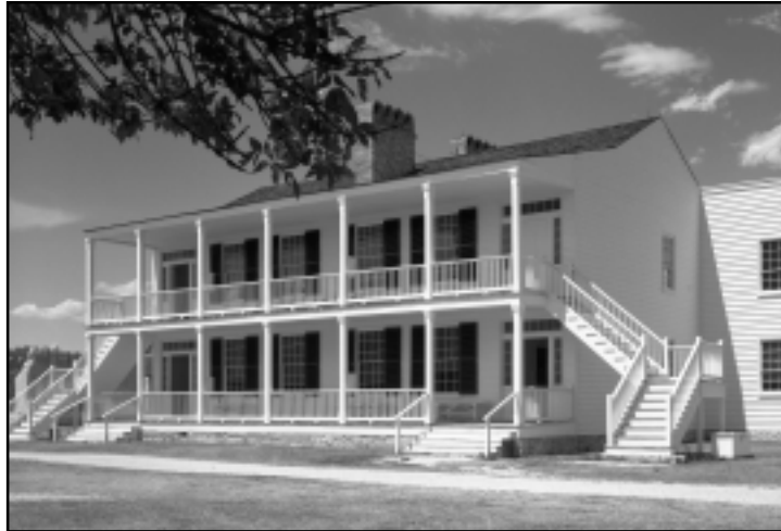
Old Bedlam, Fort Laramie.

Depending upon the technology being used, remote sensing (resistance meter, conductance and magnetometer) scans reached between 0.5 and 1.0 m below the surface. The database should now include all known historic archaeology and much of the prehistoric archeology.