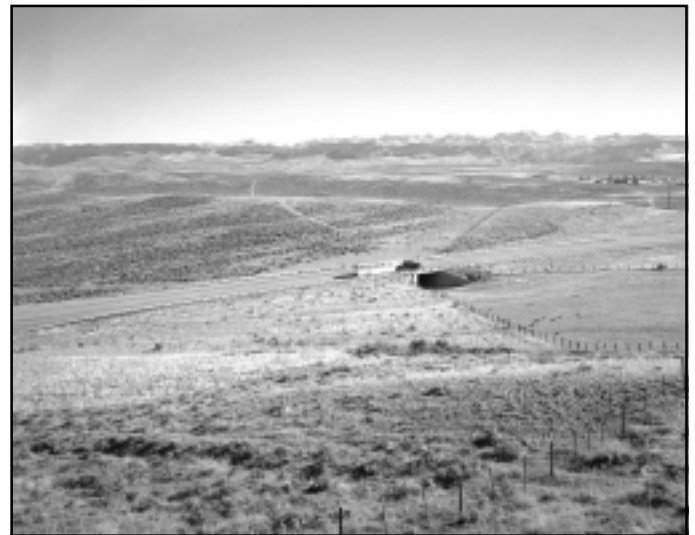
Trappers Point, near Pinedale.