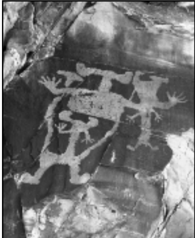
Legend Rock Site, near Thermopolis.

The Wyoming Site Stewardship Program was recently established to help protect the state's most vulnerable cultural resources. Cosponsored by the Wyoming State Historic Preservation Office (SHPO) and the Bureau of Land Management (BLM), the program will effectively train potential stewards and place them at geographically isolated sites with the goal to deter looting and vandalism of sensitive archaeological areas. It is a sad reality, but Wyoming has experienced