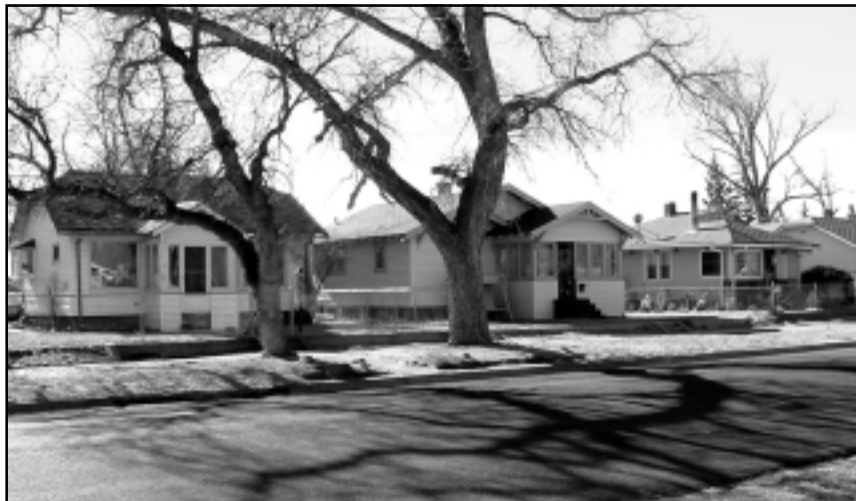
Cheyenne South Side District, E. 8th Street.

countries converged on Cheyenne during the late 19th and early 20th centuries, creating a diverse ethnic community, which has essentially stayed the same since the end of World War II. Architecturally distinct homes line the streets surrounded by schools and churches. The District nomination is a true success story for two reasons. First, the community was firmly behind the nomination, and second, the neighborhood itself is a vintage example of working-class life in Wyoming.