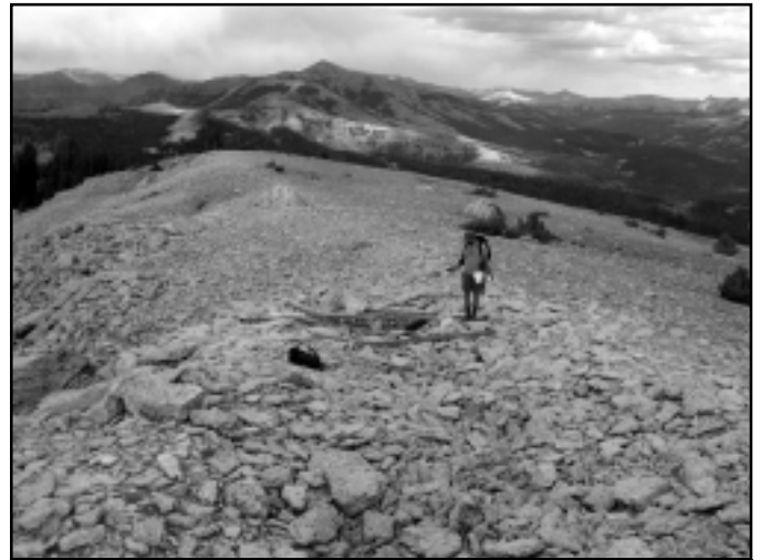
Prehistoric/protohistoric hunting blind at the timberline in the South Absaroka Range.

Adams presented two papers at the 64 th Plains Anthropological Conference in Topeka. One paper explored the possibility that Late Prehistoric Shoshones at the "High Rise Village" site were harvesting and processing whitebark pine nuts for a winter food supply. The second paper is based on Adam's article on "The Greater Yellowstone Ecosystem, Soapstone Bowls, and the Mountain Shoshone" that was published in a special edition of World Archaeology dedicated to high altitude archaeology. Contact him at radams@state.wy.us for a copy of the article.