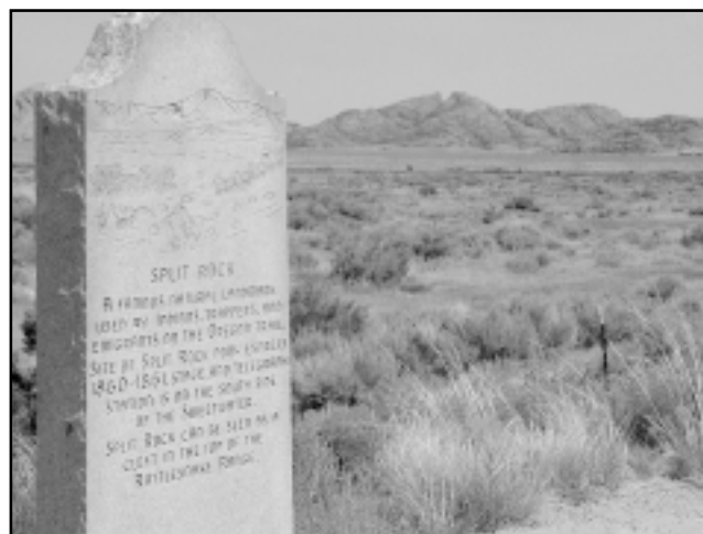
Split Rock marker, near Jeffrey City.

In 2006, the Wyoming SHPO worked closely with the Wyoming Department of Transportation, Wyoming State Parks, and the Department of Wyoming Travel and Tourism to revamp its Monuments and Markers program across the state. The SHPO, working in conjunction with these other state agencies, has begun to digitally catalogue, review, and install new monuments, markers, and signs across the state. The SHPO has three priorities regarding Wyoming's Monuments and Markers Program: 1) review several of the older signs across the state to determine if they need replacement or repair; 2) revise the review and authorization process for signs and