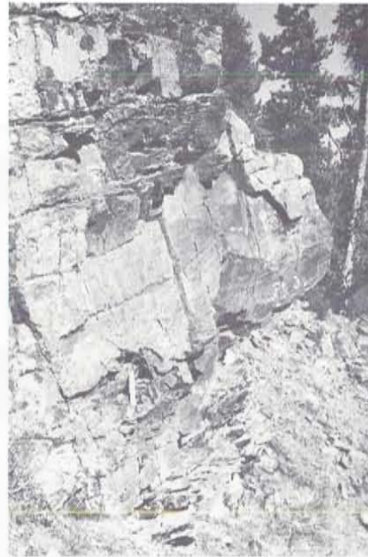
Fig. 3. Typical outcrop of quartz-biotite schist, showing close rectangular jointing (6-inch rule); west side of Douglas Creek, four-tenths of a mile north of Gold Run.