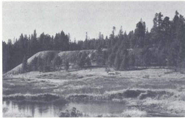
Fig. 5. View northwest across Moore's Gulch, site of 1868 gold discovery; dump of Albany mine in background.