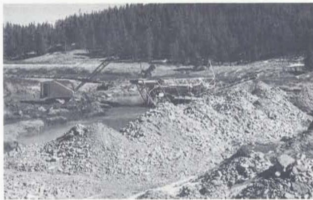
Fig. 6. Moe Brothers 1958 placer operation on upper Douglas Creek, near Gold Run, showing dragline and floating washing plant.

The fineness and silver-platinum content of the placer gold agree closely with that of gold from local primary deposits. This, together with the fact that much of the coarser placer gold is but slightly rounded, sometimes with quartz still attached, suggests that the placer gold is locally derived.