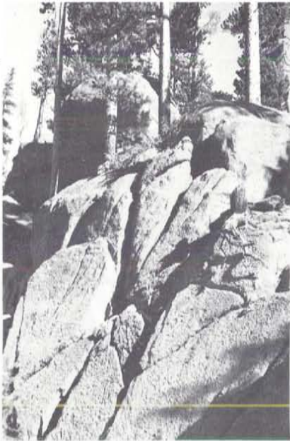
Fig. 2. Large outcrop of quartz diorite, showing characteristic enlarged joints; east side of Douglas Creek, about one mile north of Muddy Creek.