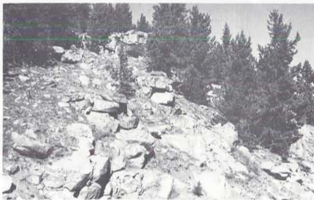
Fig. 4. Typical low, scattered, rounded to angular-fractured exposures of quartz-feldspar gneiss (microcline-rich phase); near confluence of Horse and Douglas Creeks.