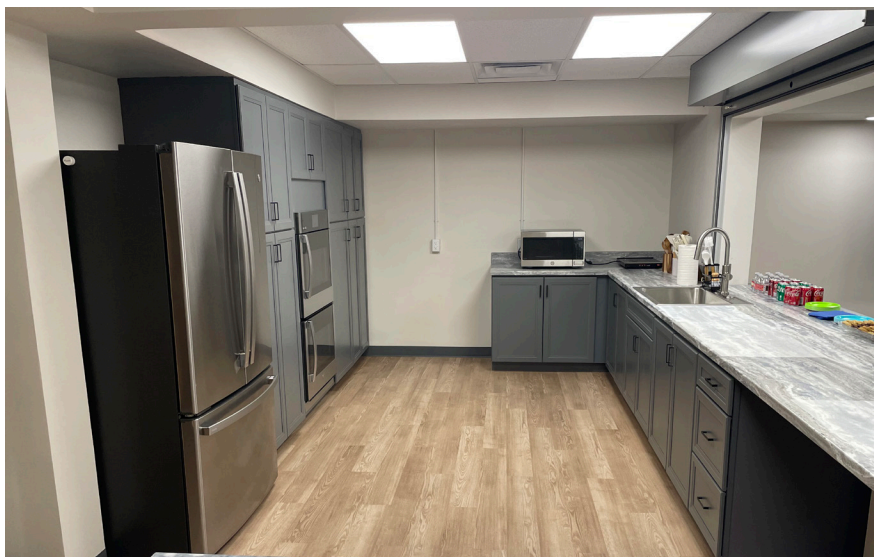
The new space includes a full kitchen and a bright and welcoming space for community members to gather.

The Sweetwater County Library System consists of three main libraries (one in Green River and two in Rock Springs), six rural branch libraries (one each in the communities of Bairoil, Farson, Granger, Reliance, Superior, and Wamsutter), and the Community Fine Arts Center, which is adjacent to the Rock Springs Library. All locations provide exceptional resources, services, programs, and events to their patrons. Find out more about the Sweetwater County Library System on their website .