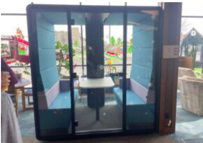
The new hush pod provides a private space to work, study, or meet with a small group.

The Uinta County Libraries include the main library in Evanston, as well as branch libraries in Lyman and Mountain View. Learn more about the programs and events each library offers on their website .