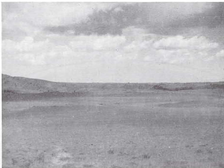
FIG. 6. View northeast across metanorite area. Cordierite deposits form low hills; higher hills in background are anorthosite.

and are lenticular in plan. Layers of cordierite-bearing rock in syenite and in the mixed-rock zone have the same shape, suggesting a common form of cordierite bodies regardless of size. In places, two or three lenses are aligned. A few outcrops expose short tabular masses which appear to be almost as wide as they are long.